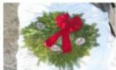
22" Decorated Wreath: $25 or 30" Decorated Wreath: $30

Thank you for your Support of this Amazing Youth Ministry of "Leading Teens Closer to Christ."