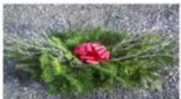
3ft. Decorated Grave Covers: $35