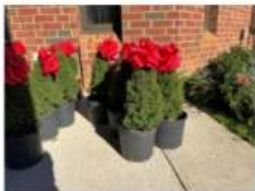
2 gallon potted Dwarf Alberta Spruce Tree: $35

Starting Saturday November 25 th at 5:00 pm Mass and Sunday November 26 th Masses: 8:00am, 10:00am, 12 noon and Life Teen 5:00pm Mass (While Supplies Last)