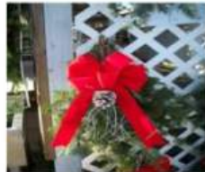
Decorated Door Swag: $15 (an alternative to a door wreath)