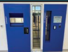
Self-Service is available 24/7