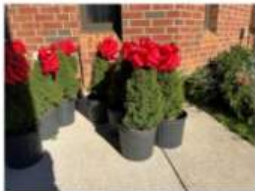
2 gallon potted Dwarf Alberta Spruce Tree: $35

Starting Saturday November 25 th at 5:00 pm Mass and Sunday November 26 th Masses: 8:00am, 10:00am, 12 noon and Life Teen 5:00pm Mass (While Supplies Last)