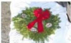
22" Decorated Wreath: $25 or 30" Decorated Wreath: $30

Thank you for your Support of this Amazing Youth Ministry of "Leading Teens Closer to Christ."