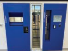
Self-Service is available 24/7