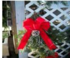
Decorated Door Swag: $15 (an alternative to a door wreath)