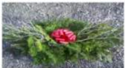
3ft. Decorated Grave Covers: $35