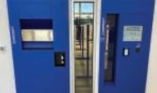
Self-Service is available 24/7